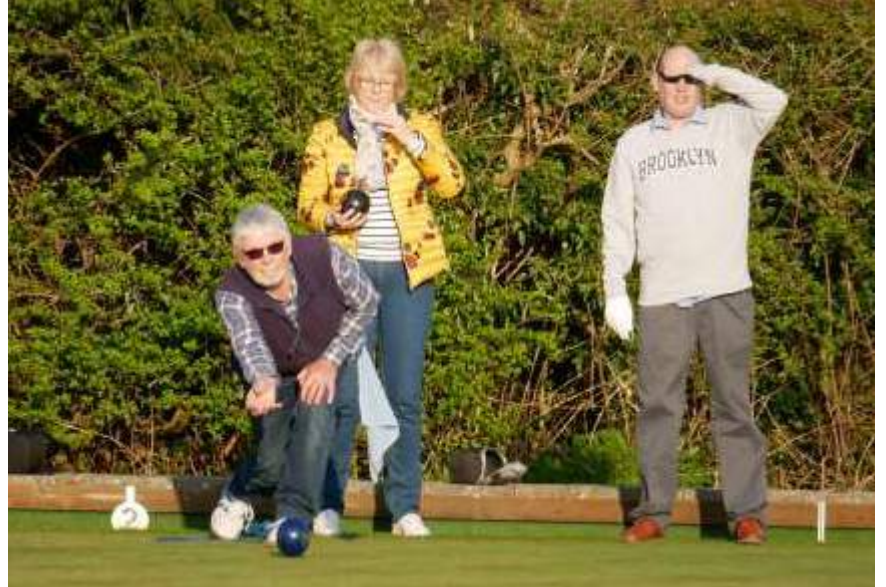
BOWLS CLUB Opening of the Green