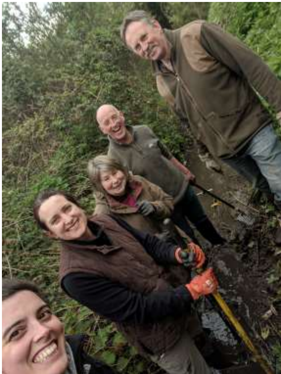
Your Parish Council clearing rubbish from the brook